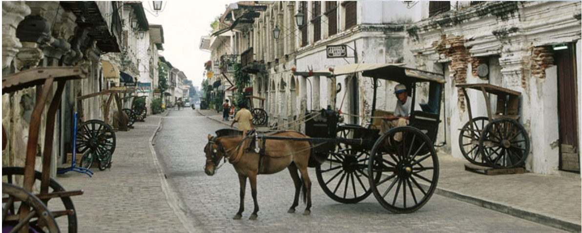
Vigan, North Luzon, Philippine.